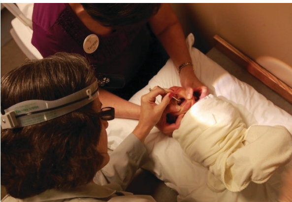
Baby getting tongue-tie clipped.

“A resource that would help me, would be, when should I think tongue-tie versus mom’s supply.”