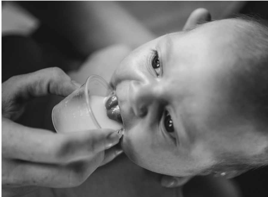
Baby with tongue-tie with typical forked tongue.

“Because of this culture, sometimes pressure even by public health to really let’s fix the tongue-tie that it can be problematic. But it is also a big financial burden for the family and can have post-operative complications.”